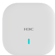
H3C WA6622 Internal Antennas 6 Streams Dual Radio Wi-Fi 6/ac/n AP