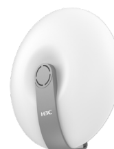
H3C WA6638 Internal Antennas 12 Streams Triple Radio Wi-Fi 6/ac/n AP