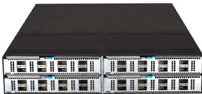
S9850-4C front panel