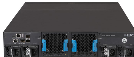
S9850-4C rear panel